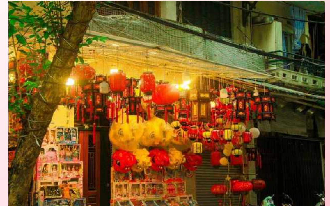
#The old quarters