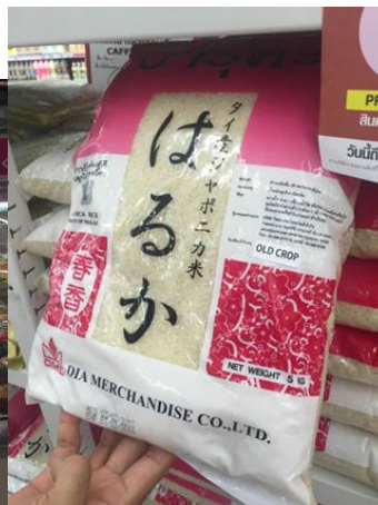
Japonica rice made by Thai company