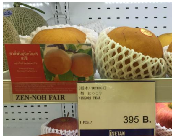
These pairs were made in Tochigi