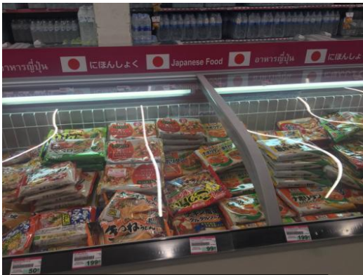
Japanese frozen foods

I went to usual Thai supermarket and Japanese supermarket “Maxvalu”. There are many Japanese processed foods. But the majority was made by Thai company, about 70%. I think that about 15% was made by Japanese company and another 15% was made by Chinese, Malaysia and so on.