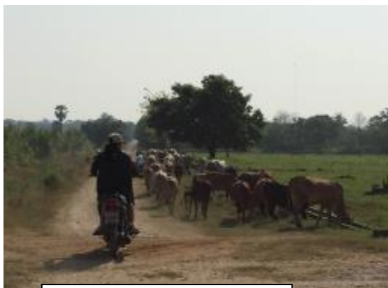
Cow farm in campus