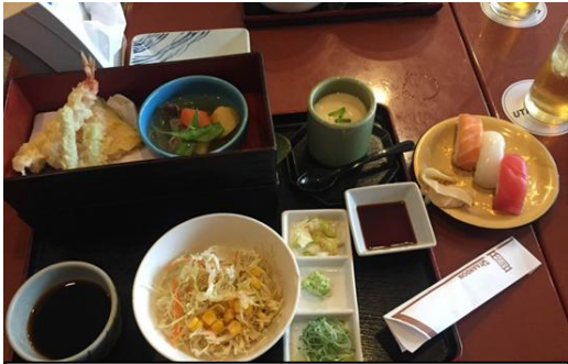
Uta-andon(in Isetan, Bangkok)

hometown. In fact, the taste of Miso and Ozoni is different according to the area in Japan. I'm sure that his restaurant is restoration of serenity looks like hometown for Japanese people who works in Thailand.