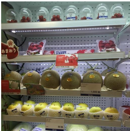
These fruits were made in Japan