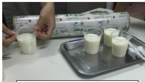
Making Pudding by goat milk