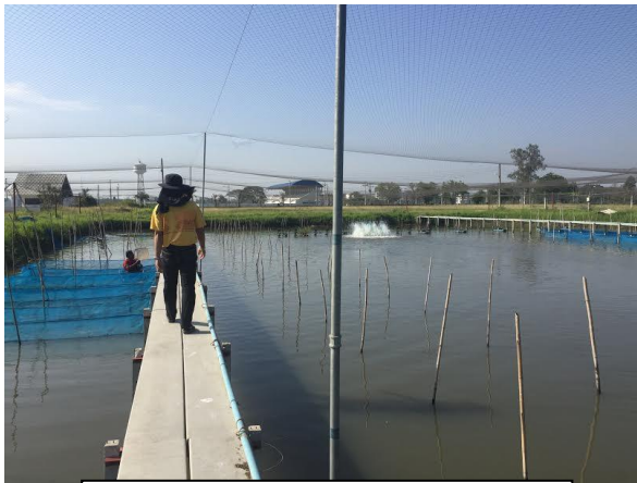
Cultivation field of Tilapia

In faculty of fishery, I learn about cultivation of Tilapia. Tilapia is a kind of representative freshwater fish in Thailand. Thai people like freshwater fish. Tilapia lays eggs from their mouth and I tried to put out eggs from their mouth. The way is to hand their head and shake them body for the lower direction.