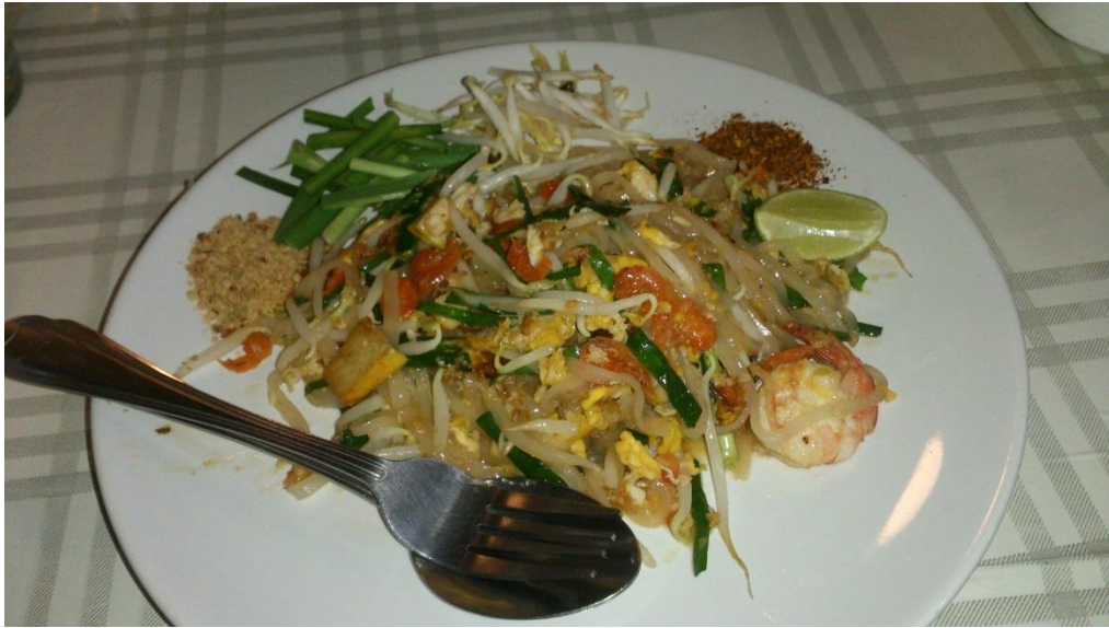
Fig6. "Pad thai"

Thai foods use various spices. Some are spicy ones and others have unique flavor. Therefore some people cannot eat some Thai foods.