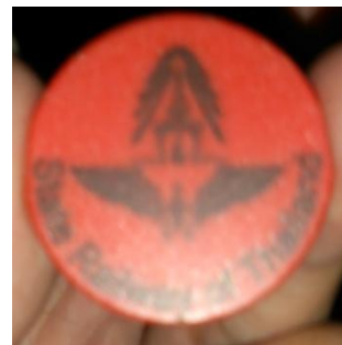
Fig5. a train ticket

In this internship, I used many means of transportation. I used train, subway, taxi and bus. They are familiar in Japan but there are other unique means in Thailand. For example, there is bike taxi in Thailand. Bike taxi is riding a motorbike by two or more people. It was very thrilling and I won't use it in future. There is water bus too. I used it when I visited The Wat Arun. Same means of transportation have a difference between Japan and Thailand. It's a train ticket. In Thailand, train tickets are IC cards or medals of plastic. They can be reused and be ecological.