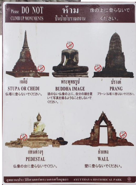
Fig3,4 Buddha’s head and Notes