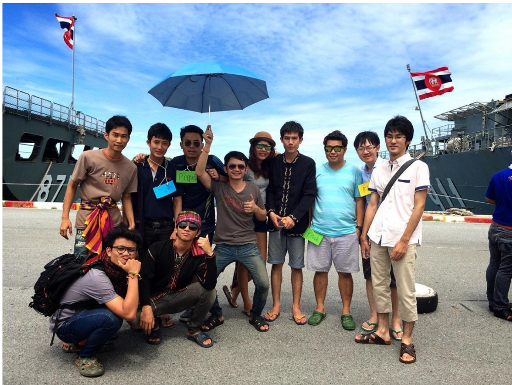
Fig2. In a port with club members

When I joined their activity, they had a club trip. We went to the sea and stayed in a camp for briefing session. In the daytime, we looked Thai Navy's ships and we played some games on a beach. I learned Thai music, dance, and some games there. I knew Thai students ordinary style too.