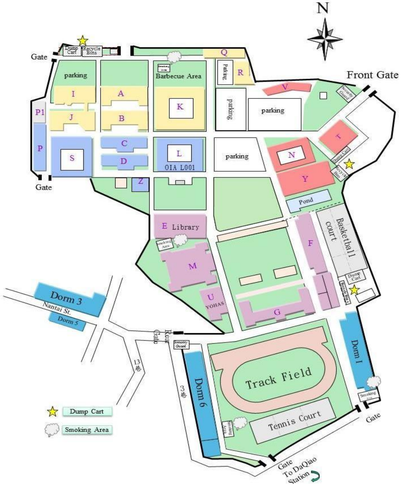
Map (Dump Cart and Smoking Areas)

Southern Taiwan University of Science and Technology