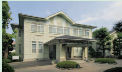
Sansui Kaikan, Registered as a Cultural Property in Japan