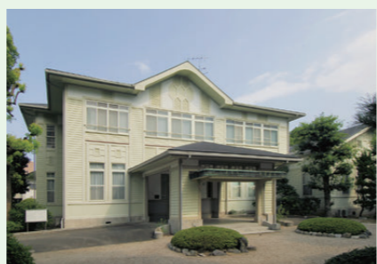
Sansui Hall, Registered as a Cultural Property in Japan