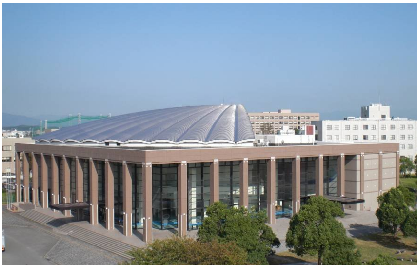
Seminar and Symposium site; Sansui Auditorium