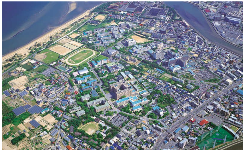
Overview of Mie University