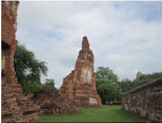
Picture11. Leaning temple building