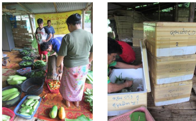
Picture.5 Packing vegetables and fruits for shipping

The harvested vegetables is gathered in the hut. In that day I inspected, there were 120kg (vegetables and fruits). They divided each kind of vegetables into sixteen and packed, one by one after weighed because they had sixteen customers. After packing, they put that vegetables and fruits into the boxes used for shipping.