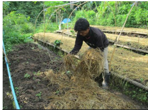
Picture.4 Covering field with rice

I caught see many kind of vegetables. Fertilizer was mainly made of rice husk and straw. After fertilization he put rice straw on there. This straw prevents weeds from growing and will become manure. Any chemical is not used for control of weeds. They harvest and wash, cut by them hands, one by one.