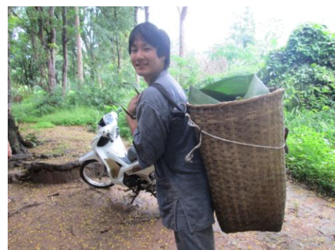
Picture.6 Carrying vegetables to the hut

I got up at AM7:30 and had breakfast. We worked from AM8:00 to AM10:00. At the