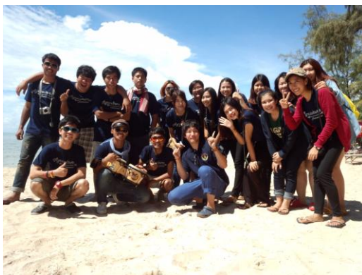
Picture.15 4 th year of TU