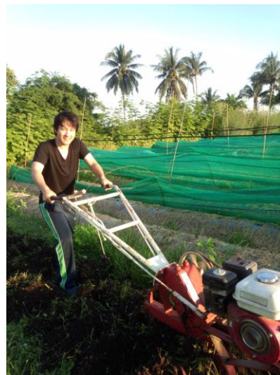
Picture.8 Plowing strawberry field by farm tractor

Next morning, I seeded cauliflower and tomato in pots with his family. Afternoon, I went back to university by bus.