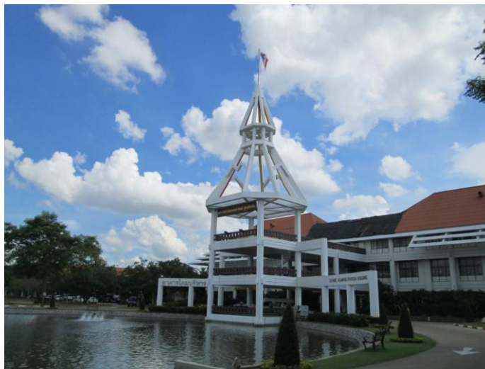
Picture.1 The symbol Tammasat University

Tnammasat University was founded in 1934 and it is the second most historical in Thailand. This university has many agreement with Japanese university besides Mie university, for example Tokyo university, Waseda university and Keiou university...etc. This university has four campuses. Tha Phra Chan is the first built campus. The Thammasat University Massacre occurred on this campus. This matter was an attack on students and protesters, and took a heavy toll of human lives. The campus I stayed was Rangsit , 42 km north of Bangkok. This campus was about five times as large as Mie university. There were hospital, dormitory, convenience store, swimming pool, pharmacy...ect, enough to live. Night market was held twice a week and there were many people, students, neighborhoods, tourists and so on. My impression about