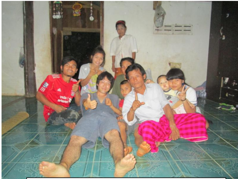
Picture.17 My favorite picture in this program

Thanks everyone I met in Thailand, I was so glad that I joined this program.