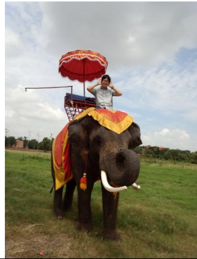
Picture.12 Riding on elephant in Ayutthaya

I joined for student tour in Rayong. This prefectures beach was most beautiful I have ever seen. Every year new student will be baptized like this picture. In the night, senior students tie a string on younger students wrist for wishing them happiness. In this tour, I could make many friends and funny time.