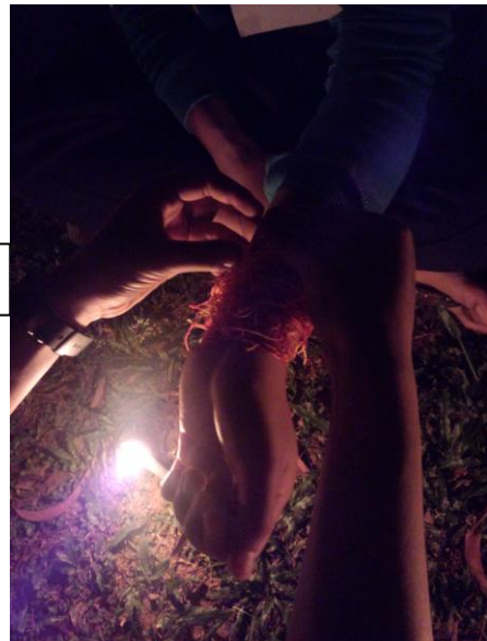
Picture.14 Tying a string with wish for happiness