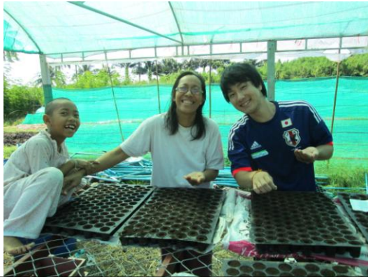
Picture9. Seeding pots with strawberry