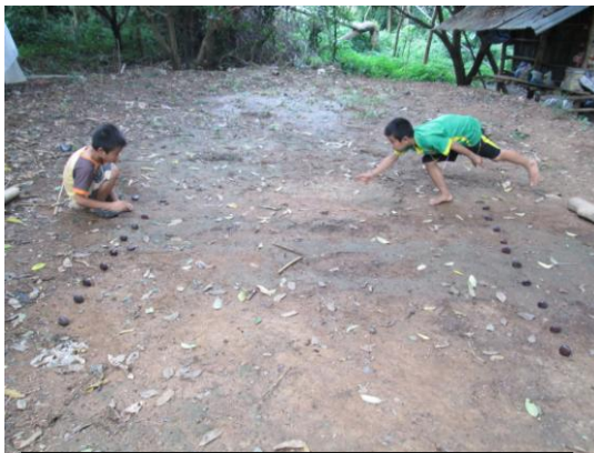
Picture.15 Children play the game